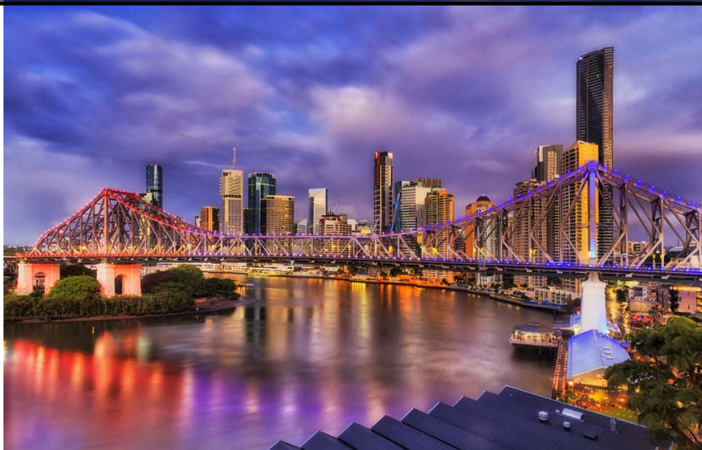
The Story Bridge in Brisbane, QLD - Australia.

(The details will be announced after August)