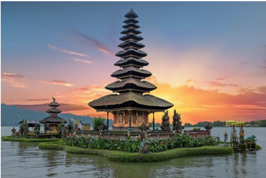
Pura Ulun Danu Bratan, Bali, Indonesia