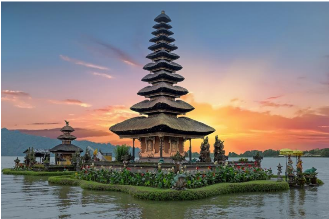
Pura Ulun Danu Bratan, Bali, Indonesia

“Smarter and Cleaner Electricity for Better Life”