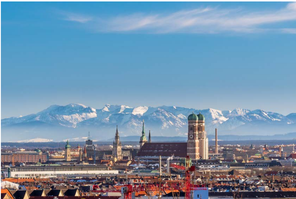
Frauenkirche Munich in front of Alpine panorama