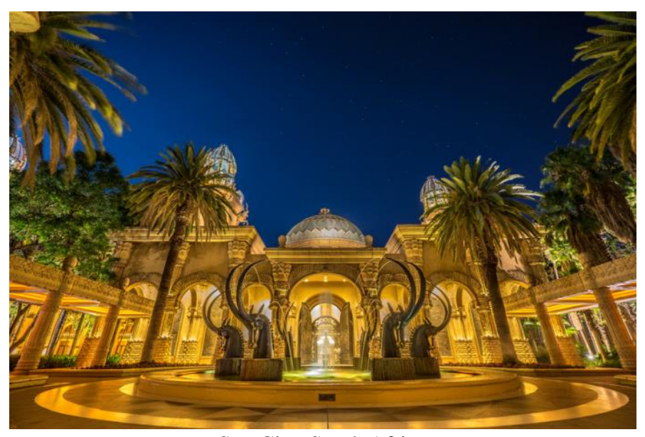
Sun City, South Africa

October 28 - 31, 2019 Sun City, South Africa