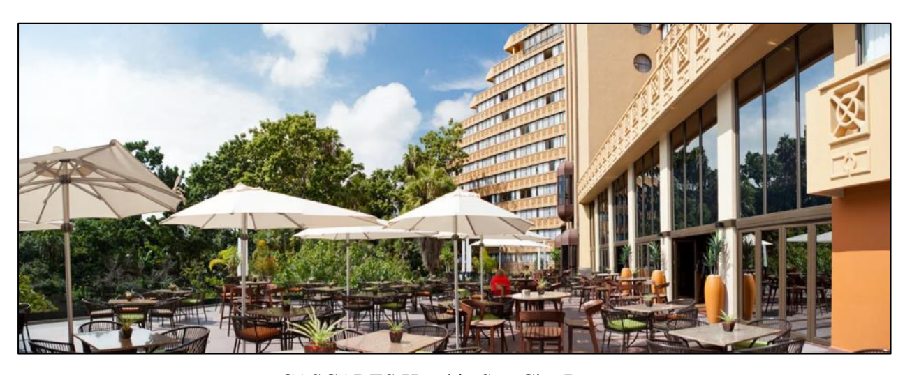
CASCADES Hotel in Sun City Resort