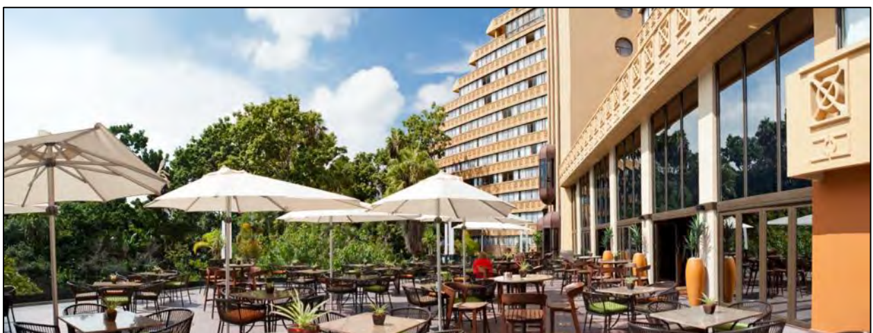
CASCADES Hotel in Sun City Resort