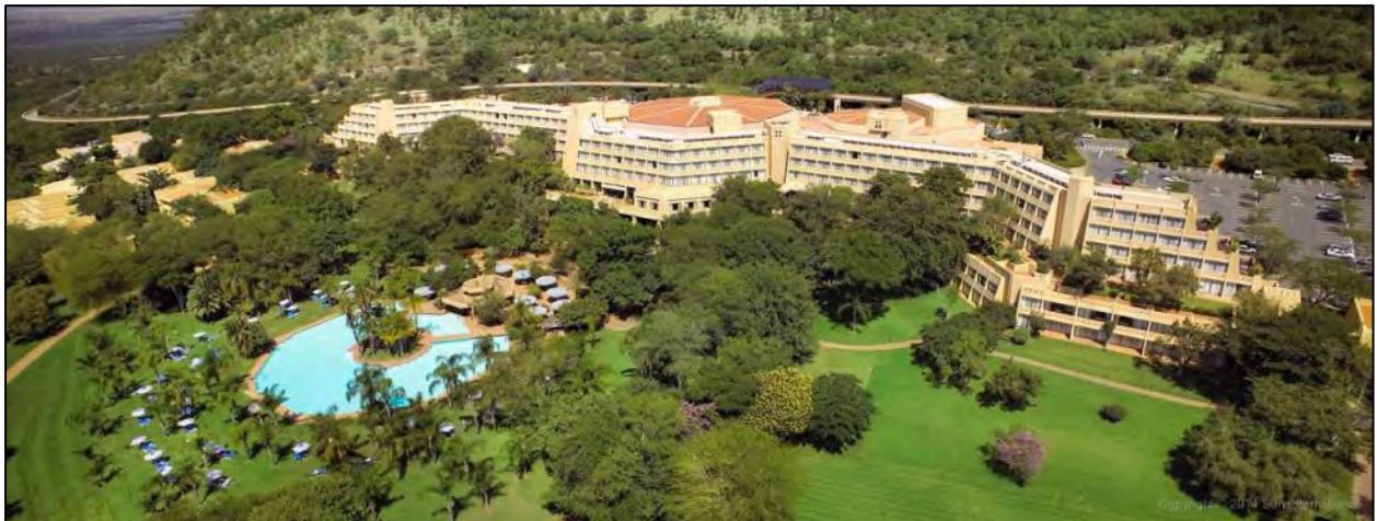
Soho Hotel in Sun City Resort