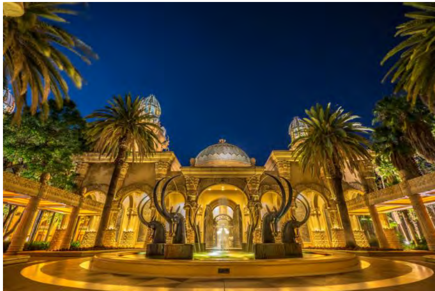
Sun City, South Africa