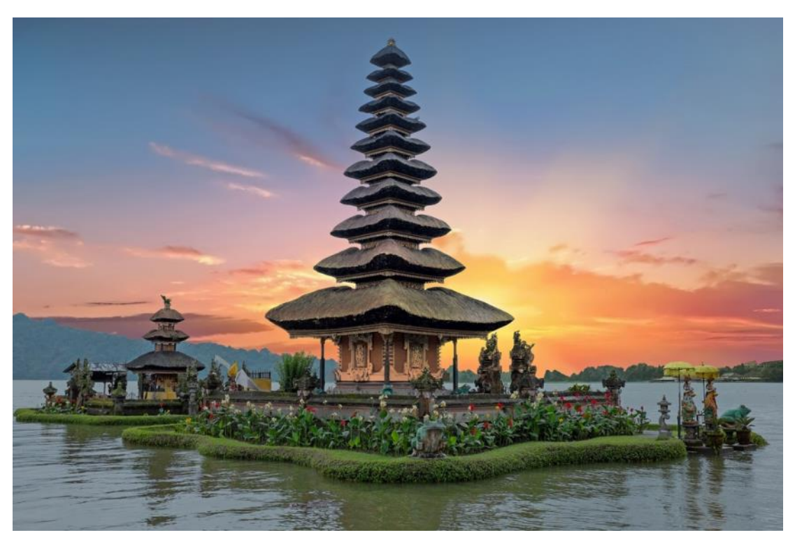
Pura Ulun Danu Bratan, Bali, Indonesia